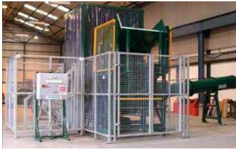
Complete revolution™ 2000 series system installation with control panel, safety guarding, pallet tipper and lift equipment

Processors are currently available in three sizes with custom options to satisfy specific end-user requirements such as enlarged hoppers, bin-lift and pallet tipper feed apparatus.