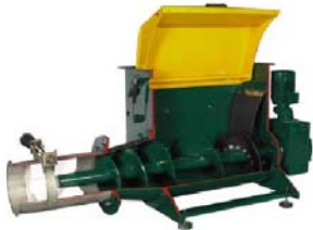
Cut-away sectional view of revolution™ 400 series compaction unit showing patented screw and spring loaded compression cone.